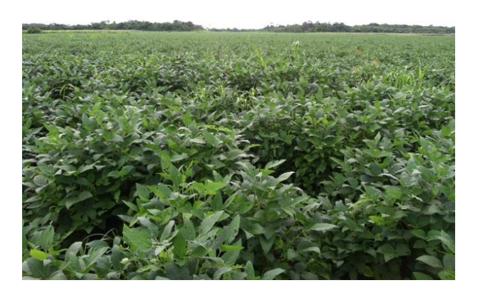
Field #JN1 – Planted June 27, 2013: 60 acres