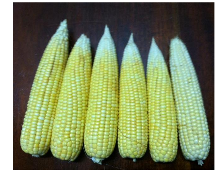
D&H Corn (Aug 31, 2013)