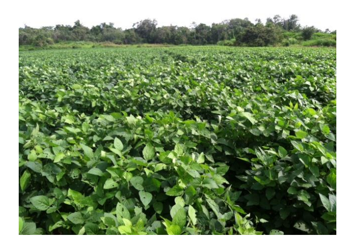
Field # JN2 - Planted June 27, 2013: 20 acres