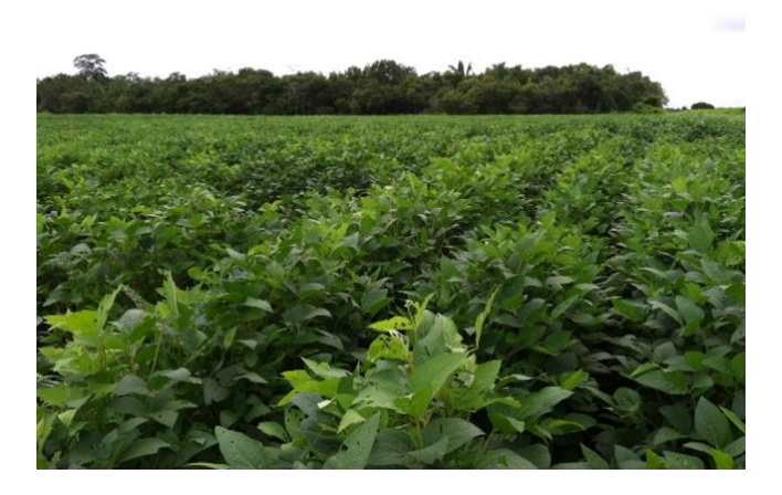
Field #JN4- Planted June 28, 2013: 20 acres

Jacob Neufeld finished planting on June 28, 2013, and despite what looked at first like a low stand on his field, the crop is now looking very good. These fields have received several inches of rain in the last week, although the red soils in the San Carlos area tend to drain very well. These beans are really looking good! As can be seen below the beans are starting to flower nicely. Plants are 32 - 38 inches tall.