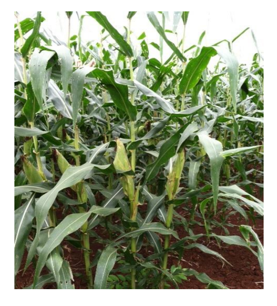
TF Plantation Field TF4 (Sept. 2, 2013)