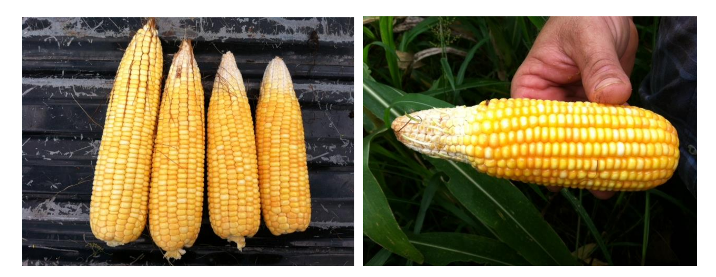
Ear Comparison: selection of corn ears from Thiessen fields (left) and worm affected ear (right)

The Thiessen crop continues to look very good! At this point the Thiessens can only sit back and wait for the corn to get ready for harvest. Insects and weeds should no longer be of major concern, as the corn has progressed through its more vulnerable stages, although the fields will be subject to regular inspection and prompt remedial spraying. The ears are drying nicely, kernels are getting hard. Harvest should be in the last week of September. One spray application of Tordon or 2,4-D will be done this week for vines that are starting to show up and will be a problem for harvesting if not addressed.