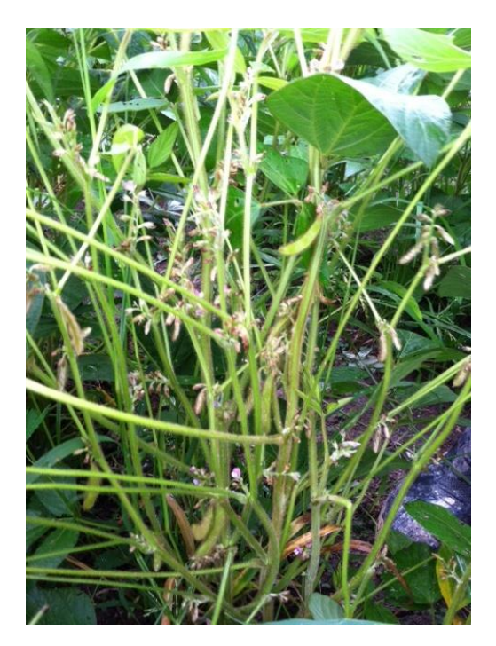
D&H Soybean Field (Aug 31, 2013)