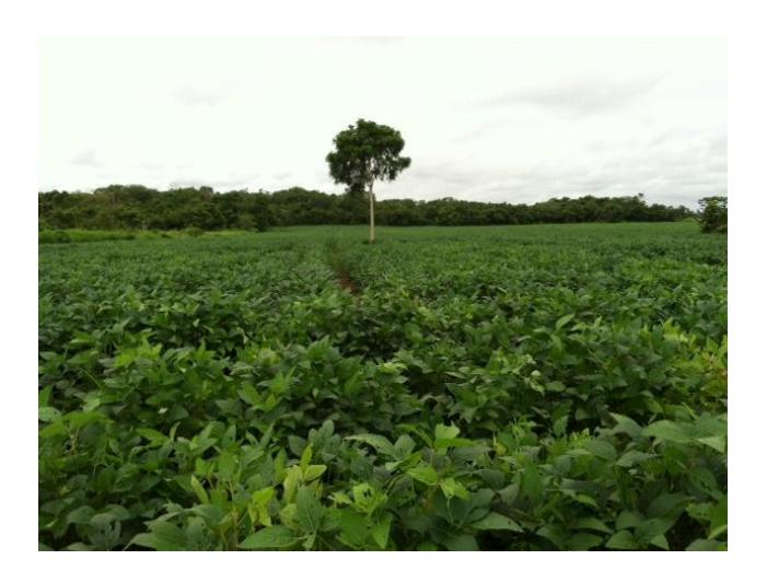
Field #JN3- Planted June 27, 2013: 17 acres