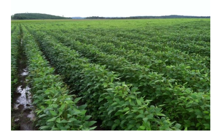
D&H Soybean Field (Aug 31, 2013)

The soybeans were planted June 27-28 and they are currently about 28 - 30 inches tall. 7 inches of rain fell this week on this field and soil conditions are now distinctly in the wet category. This field still has a bit of a grass problem; it does not seem to be affecting the plants too much in the flowering at this time. Plants are looking good: they have grown nicely this last week and continue to improve in color. Typical plant height for this variety (Huasteca 400) is around 30"-34"; these plants currently are ~28". I expected them to be full height by the time they finish blossoming. This variety is more resistant to disease and high moisture, but can also take drier conditions than other varieties. The third and fourth picture below, show that the plants are loading up nicely with flowers and pods. The rain that we have been having this last week is a bit of a concern for flowering. However, so far I have not seen any flowers or pods fall off due to rain or fungus.