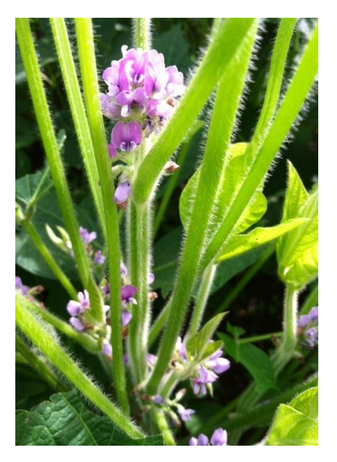
JN3 in full flowering (Aug 26, 2013)

JN2 at tail end of Flowering (Aug 31, 2013)