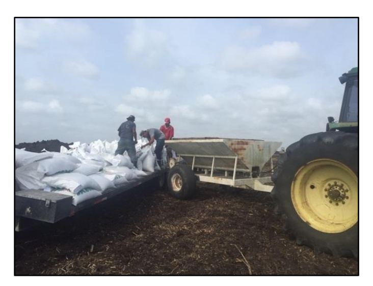
Base Fertilizer loading into spreader – May 20, 2016