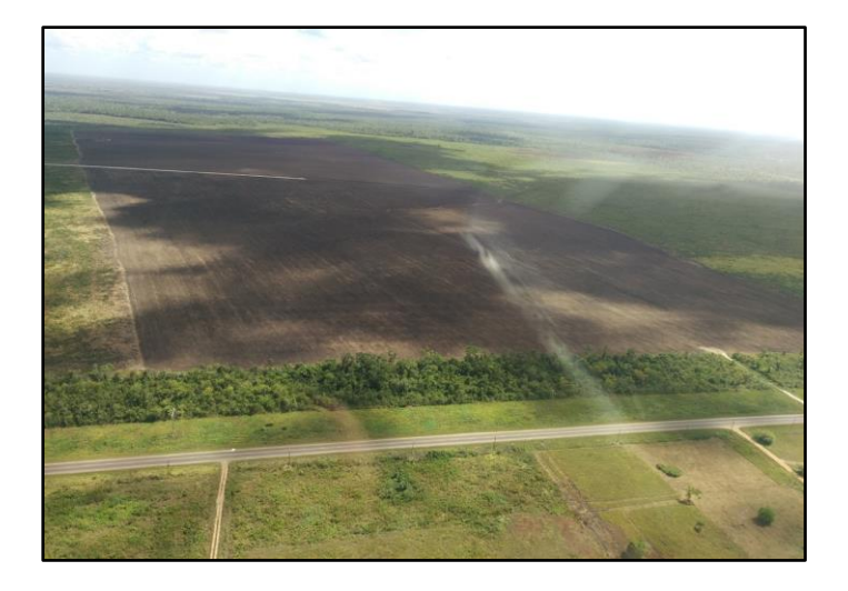
Cayo One Northerly view day before planting - May 27, '16