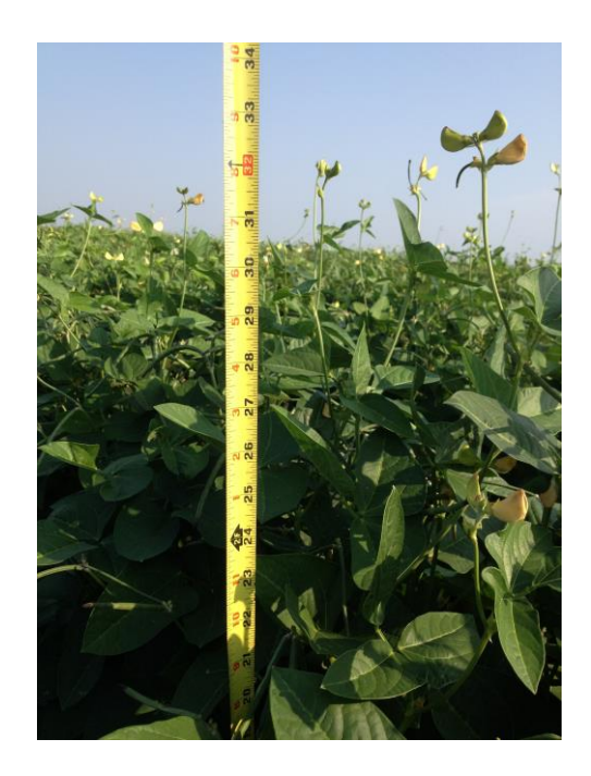
JSN Black Eye (April 7, 2014)