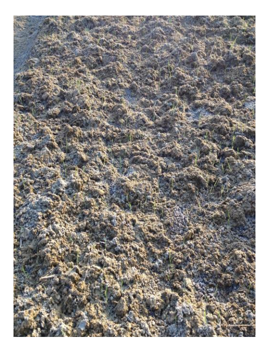
Marlon Dyck Rice Fields (April 7, 2014)