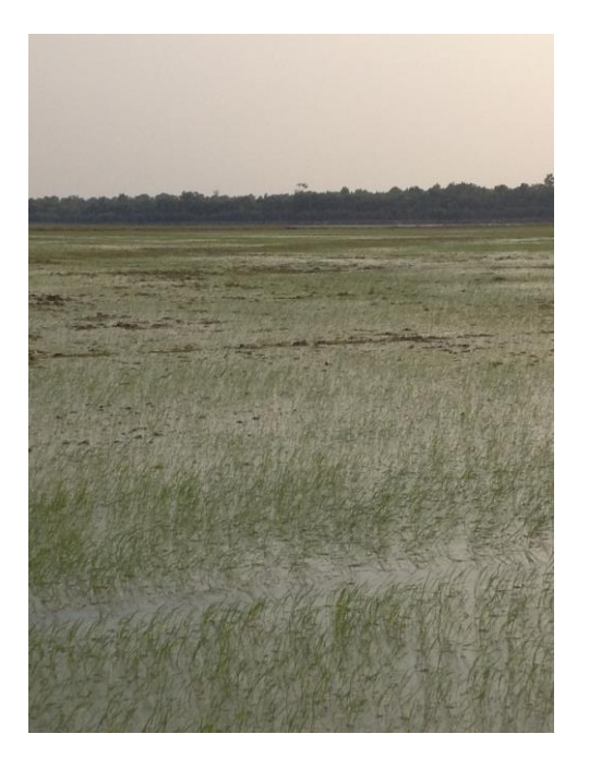
Marlon Dyck Rice Fields (April 7, 2014)