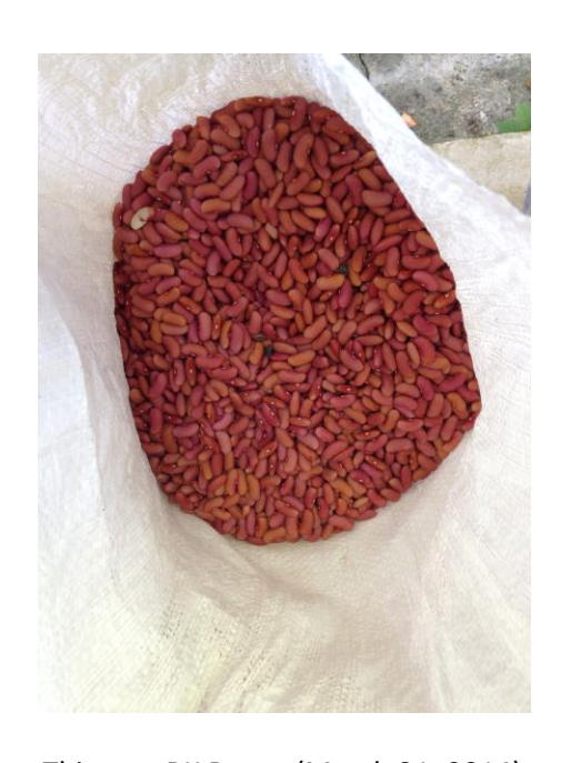
Thiessen RK Beans (March 31, 2014)