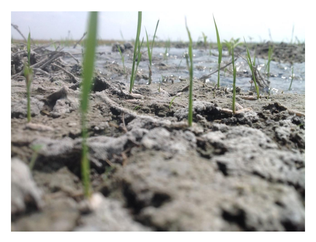
Close up view of early germination – Marlon Dyck 220 Fields (April 7, 2014)