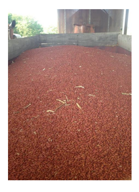
Thiessen RK Beans (March 6, 2014)

The LRKs have been a highly successful crop. Crop cost/acre was ~BZD 1,050 versus revenue per acre of ~BZD 2,600! While LRK prices are historically high and may fall back in the future, we also believe that yields have the potential for further improvement, which could offset lower prices. We consider this crop clearly demonstrates the potential of a dry season crop of edible beans. Moreover, there is very substantial demand for edible beans throughout the Caricom region, where Belize benefits from a highly preferential tariff position that should ensure favorable pricing.