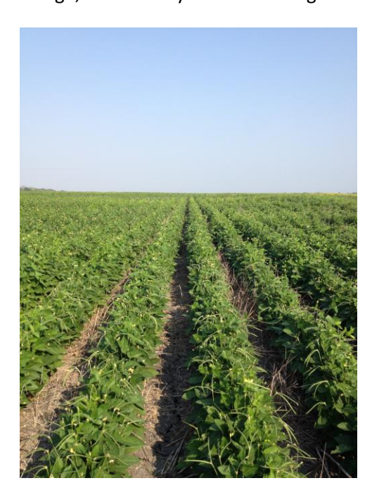
JSN Black Eye (April 7, 2014)

Jacob planted 70 acres of BEB on February 18<sup>th</sup> and 30 acres on February 21<sup>st</sup>, for a total of 100 acres. The beans are 7 weeks into their growing stage. A few small spots are suffering from nutrient deficiency due to varying soil conditions. Overall though, the black eyed beans look good.