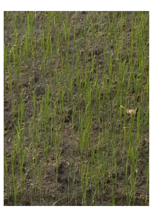
JSN Rice Fields (April 7, 2014)