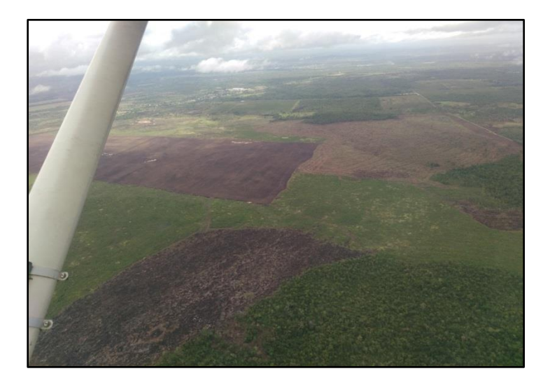
Westerly view of Cayo One – June 2<sup>nd</sup>, 2015