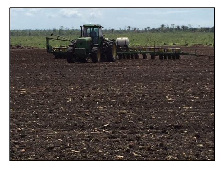
Planter on Field 1 – May 28<sup>th</sup>, 2015

Planter being prepared – May 26<sup>th</sup>, 2015