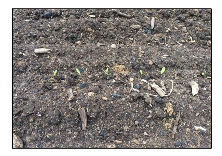
Field One emerges at Day 3 – May 30<sup>th</sup>, 2015