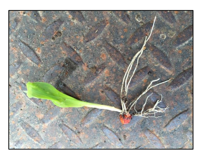
5 day old seedling – June 2<sup>nd</sup>, 2015