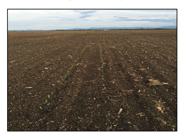
Field One at Day 8 – June 4<sup>th</sup>, 2015