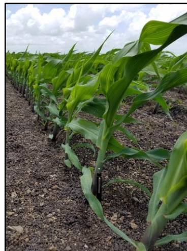
Field 2 Day 17: Syngenta Impaco® – August 4, 2017 Impacto plants show excellent development as they enter V-5