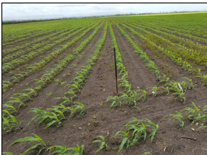
Field 1 Day 14: Corn progressing well – Aug 4, 2017 Impacto to left / Pioneer 4225 to right of stick