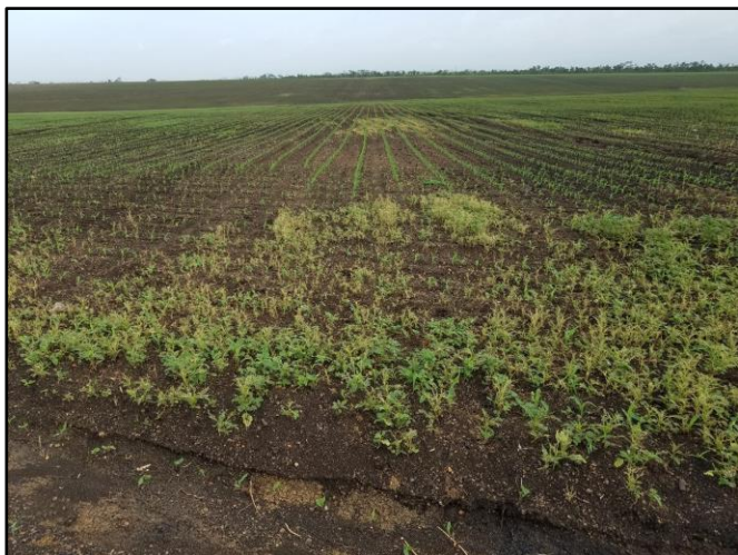
Cayo Field 1 Day 8: Weed patch devoured – July 25, 2017 Corn is undamaged thanks to Fortenza® seed treatment