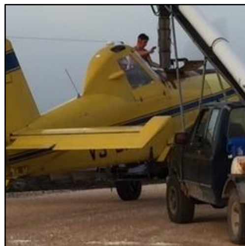
Cayo One: Air Tractor 402 Loading Fertilizer – Jul 27, 2017 Useful payload just over 1mt of fertilizer