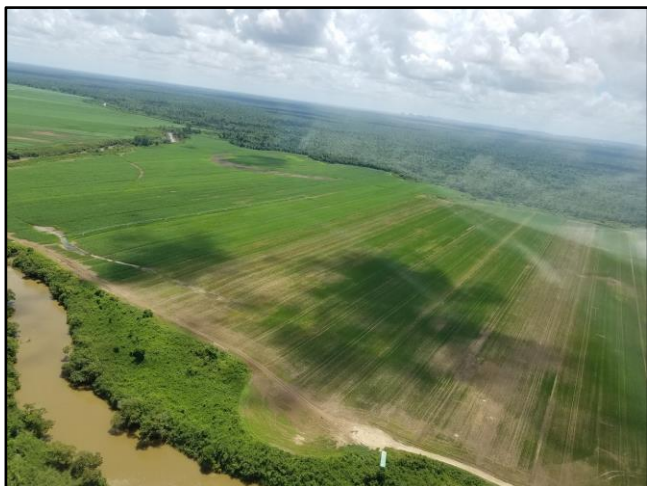
Cayo District fields North of Cayo One - July 25, 2017 Irregular or failed fields due to heavy June/July rains