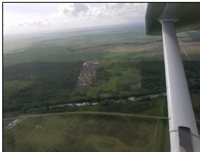
North of Cayo One: newly cleared (poor) field – July 25, 2017 Zoom in to see clear evidence of old Mayan field outlines!