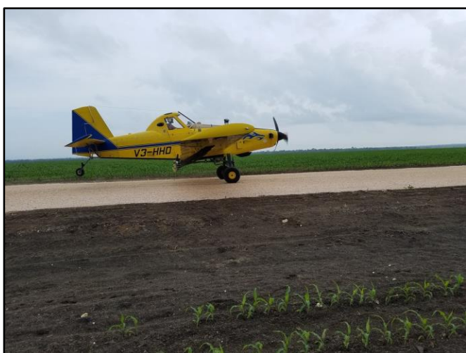
Cayo One Airstrip: Air Tractor 402 takes off – Aug 4, 2017 Wheels up with 1,600 litres of agri-chemical spray