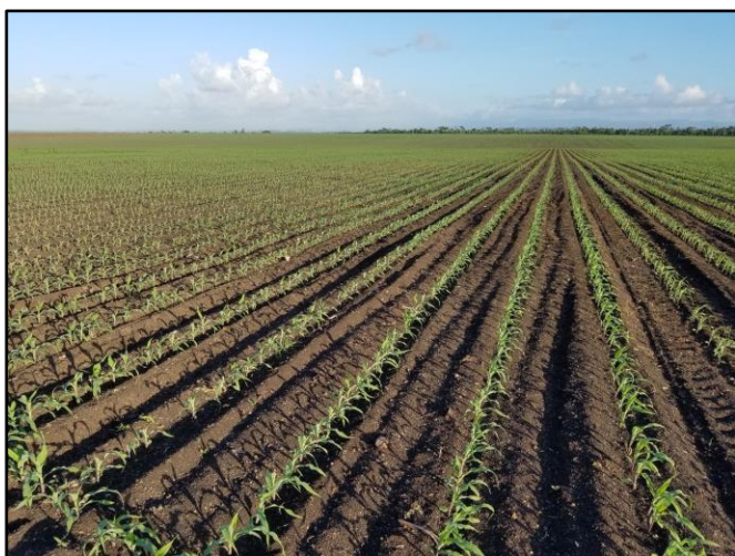
Cayo One Field 1 Day 10: July 31, 2017 Last planted field shows good weed management