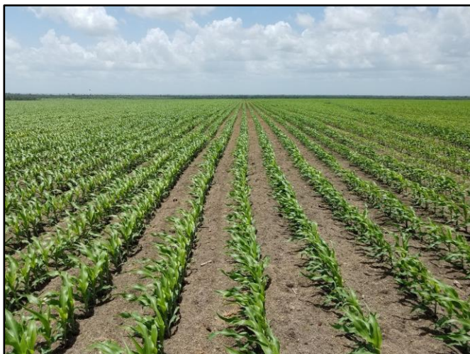
Cayo Field 2 Day 17: Corn looks very happy – Aug 4, 2017 Excellent Emergence and Vigor, no worm damage or weeds