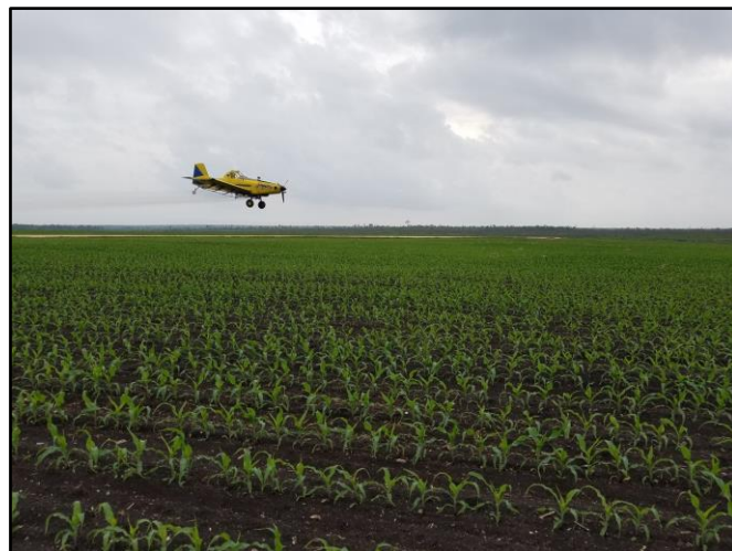
Field 2 Day 17: Aerial Spraying – August 4, 2017 Next step in worm defense: Coragen® is being sprayed on fields