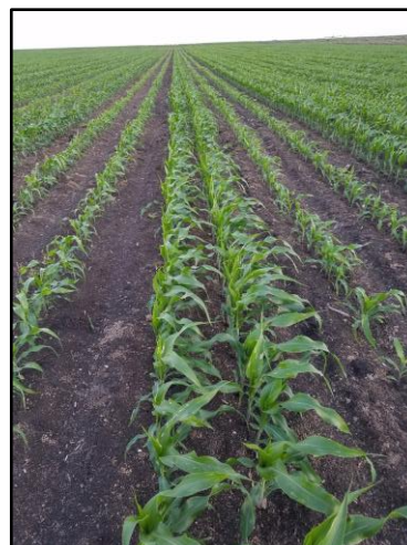
Cayo One Field 2 Day 17: (same picture) Aug 4, 2017 Note smaller row right of pair: liquid fertilizer nozzle was stuck!