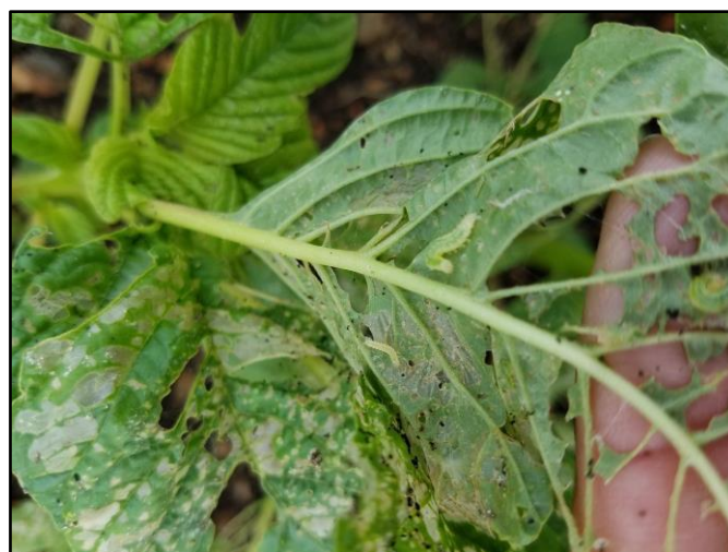
Cayo Field 1 Day 8: Close up on worms – July 25, 2017 They may be small, but they're hungry and can devour plants!