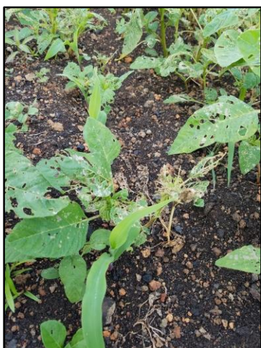
Cayo One Field 1 Day 8: Worm Damage to weeds –July 25 '17 VERY IMPORTANT: Note how the corn plant is undamaged!