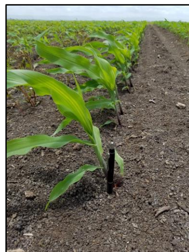
Field 1 Day 14: Syngenta Impacto© – Aug 4, 2017 Excellent Emergence and Vigor – promising start at V-3