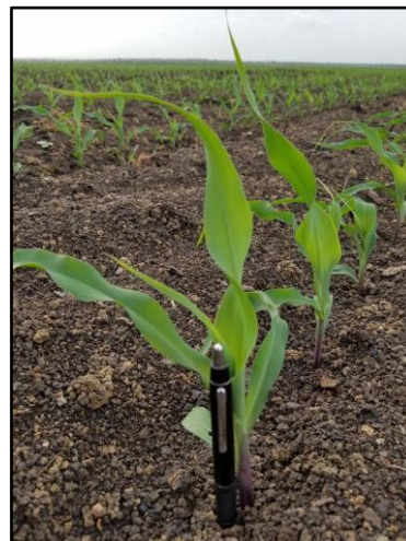
Cayo One Field 2 Day 7: Scale Picture – July 24, 2017 Healthy plants at V1-V2 Stage!