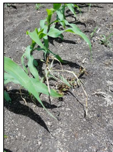
Cayo One Field 2 Day 17 – Aug 4, 2017 Calaris® at work on emerging weeds (but very healthy corn!)