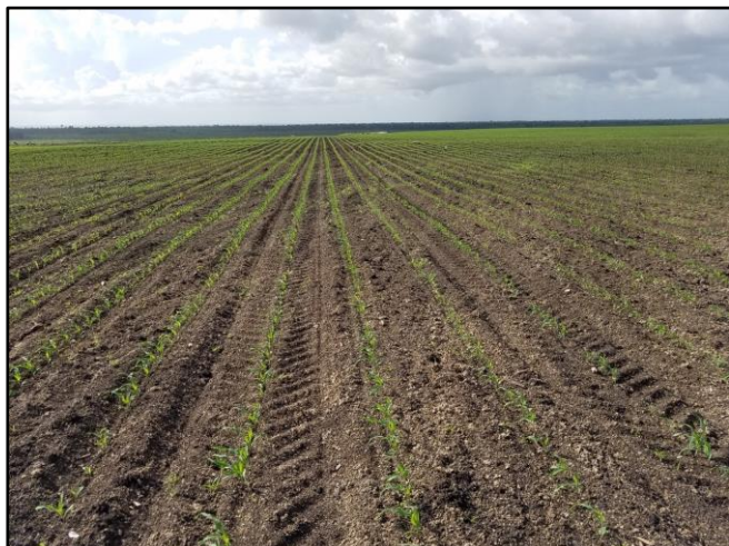
Cayo One Field 2 Day 7: Excellent Emergence – July 24, 2017 95%+ uniform emergence and early vigor are encouraging!