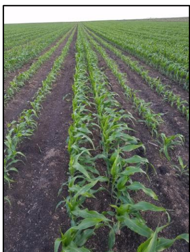
Cayo One Field 2 Day 17: Aug 4, 2017 GPS minor error places 2 rows very close, but they seem happy!