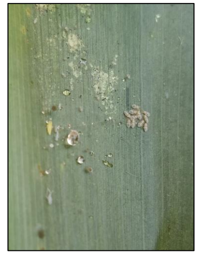
Cayo One Field 2 Day 58: Aphids – Sep 14, 2017 Young aphids beginning to appear