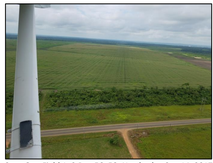
Cayo One Field 1+2 Day 56+58: Northerly - Sep 14, 2017 Early to mid Silking: fields are in good condition!