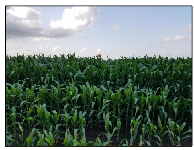
Cayo One Field 2 Day 41: V-12 to V-13 - Aug 28, 2017