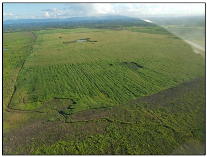
Cayo One Field 2 Day 52: Southerly view – Sep 08, 2017 Most of the field is well into tassling