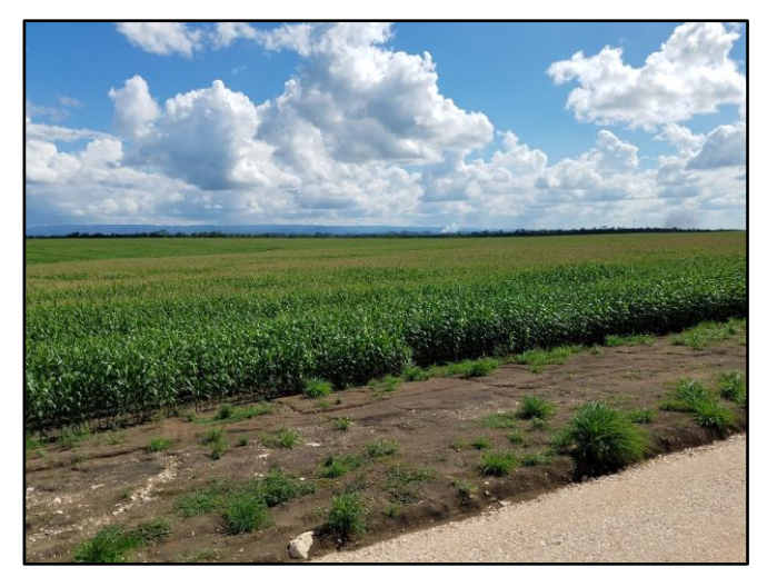
Cayo One Field 1 Day 50: entering R-1 – Sep 08, 2017 Tassling has also begun in Field 1