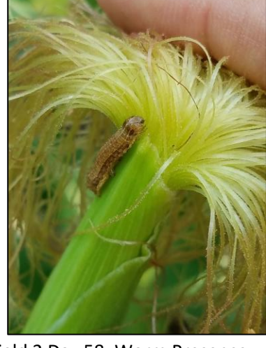
Cayo One Field 2 Day 58: Worm Presence – Sep 14, 2017 Worms like to hide under silk – but this one is also dying!