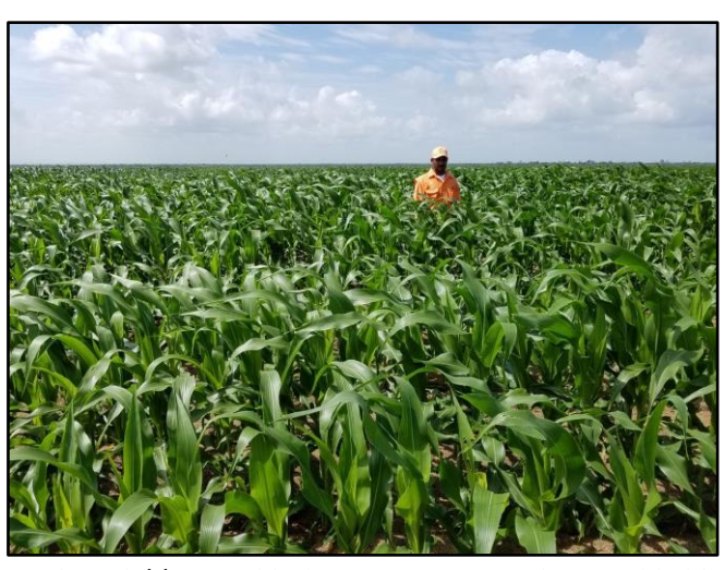
Cayo One Field 1 Day 39: Corn at V-11 to V-12 - Aug 28, 2017