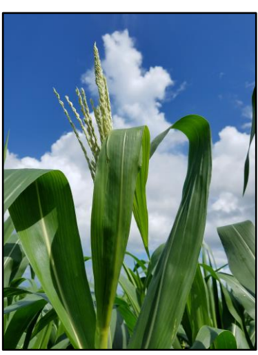
Cayo One Field 2 Day 45: Corn already at V-T Sep 01, 2017 Tassles emerging throughout Field 2: last chance to apply urea!