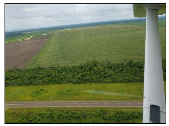
Cayo One Field 1 Day 56: Eastern edge — Sep 14, 2017 Note the lighter color Pioneer® 4226 tassles on left of field