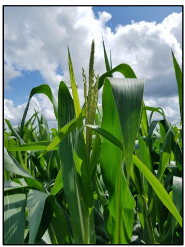
Cayo One Field 2 Day 45: Corn already at V-T Sep 01, 2017 Tassles are breaking out over 10 days early!