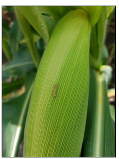
Cayo One Field 2 Day 58: Worm – Sep 14, 2017 Zoom in to see worm – dark head indicates it's dying