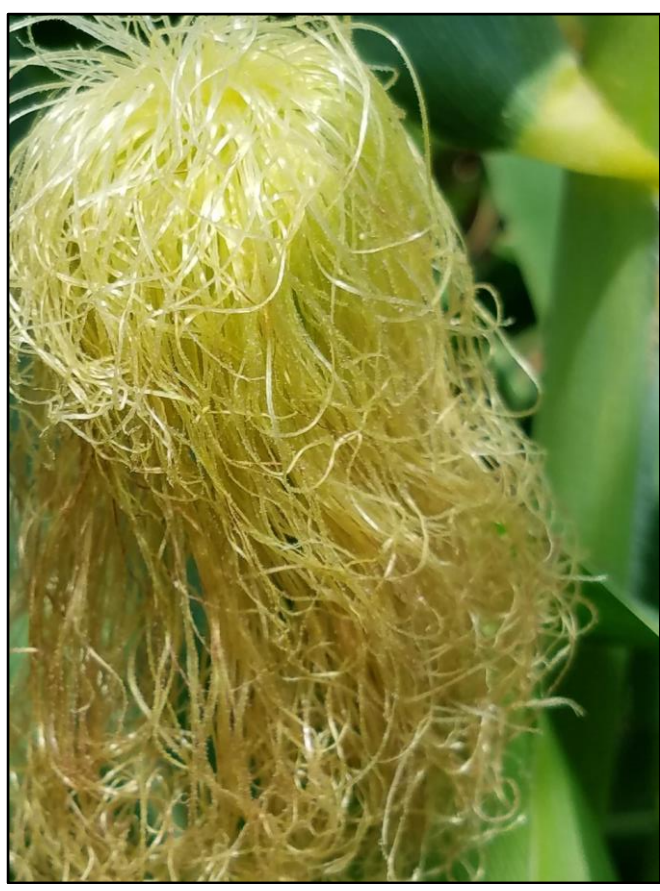
Cayo One Field 2 Day 58: Silking – Sep 14, 2017 Zoom in to see pollen on silks: Mother Nature at work reproducing