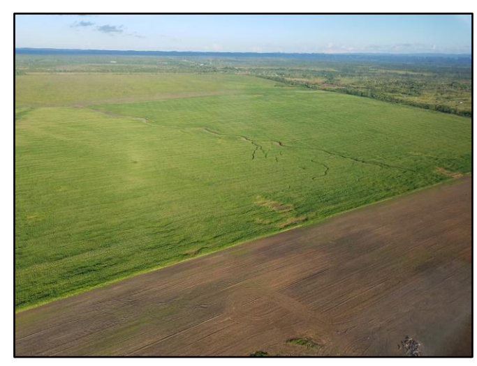
Cayo One Field 1 Day 50: Easterly – Sep 08, 2017 Tassling has started!