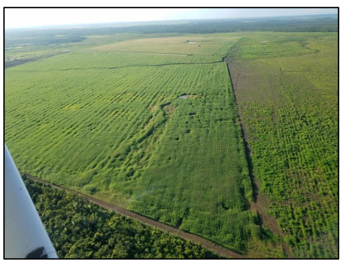
Cayo One Field 1 Day 50: Northerly – Sep 08, 2017 Some low spots that willneed more levelling next winter