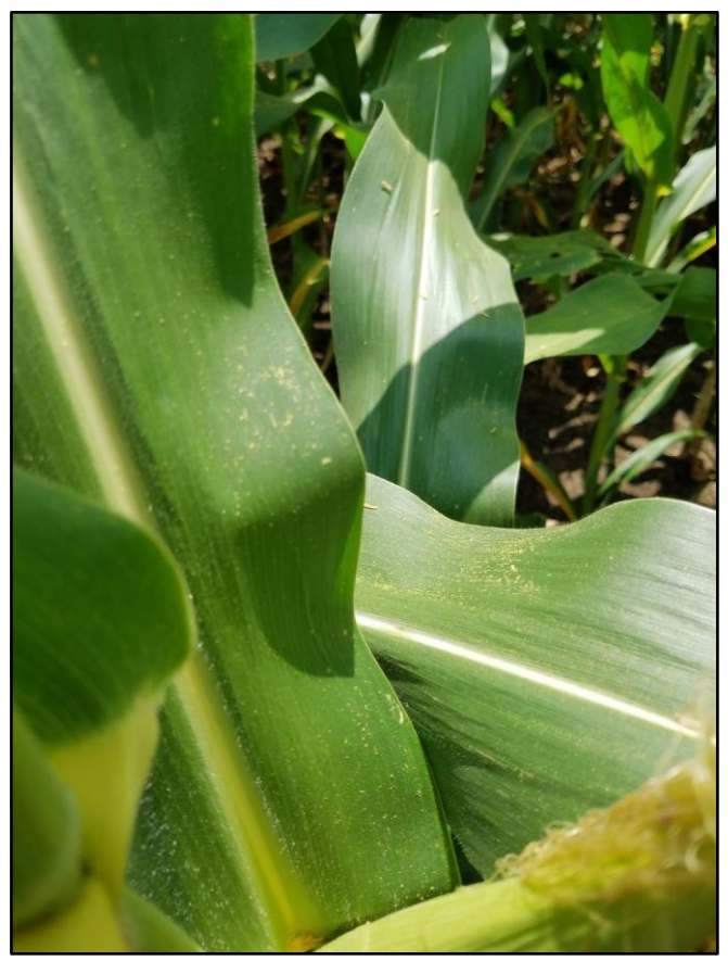
Cayo One Field 2 Day 58: Pollination – Sep 14, 2017 Pollen visible on corn leaves