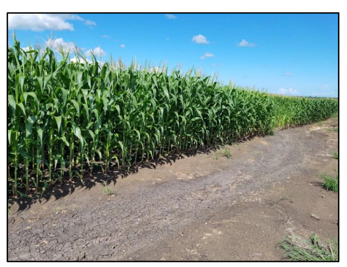
Cayo One Field 2 Day 52: Closeup look – Sep 08, 2017 Well developed corn that is tassling