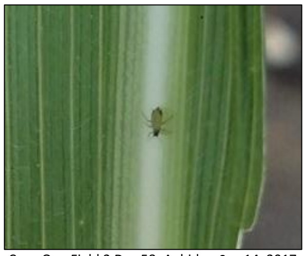
Cayo One Field 2 Day 58: Aphids – Sep 14, 2017 Adult Aphid – most should be dead after Sep 15 spraying