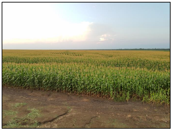
Cayo One Field 2 Day 58: Northerly view – Sep 14, 2017 Well developed field that is passing "Mid-Silk"