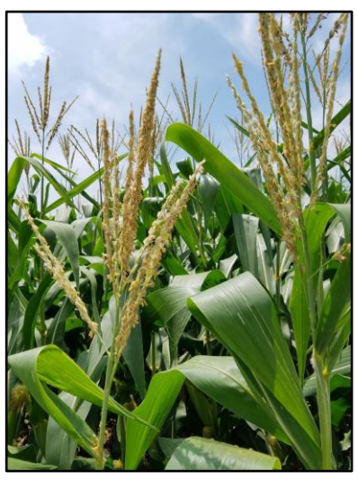
Cayo One Field 2 Day 58: Corn Tassles – Sep 14, 2017 Tassles are fully developed and pollinating