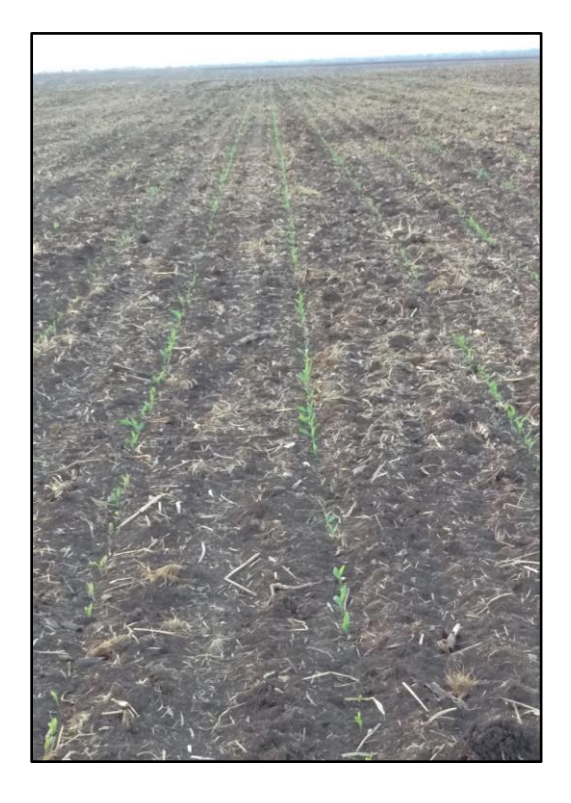
Field 2 Emergence Day 8 - June 9, 2016