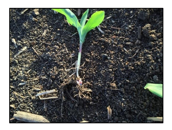
DK 7088 Vigorous Sprout on Day 9 – June 10, 2016