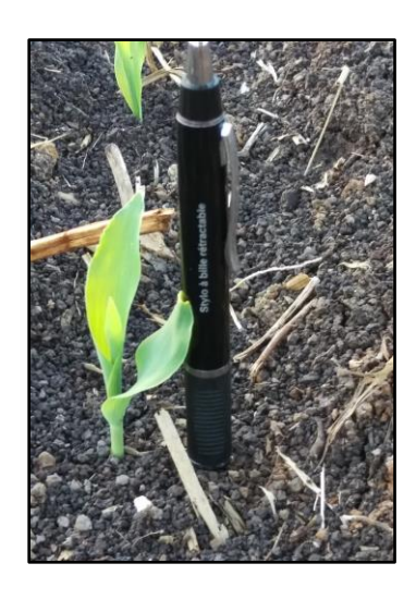
Healthy Corn Sprout on Day 8 – June 9, 2016