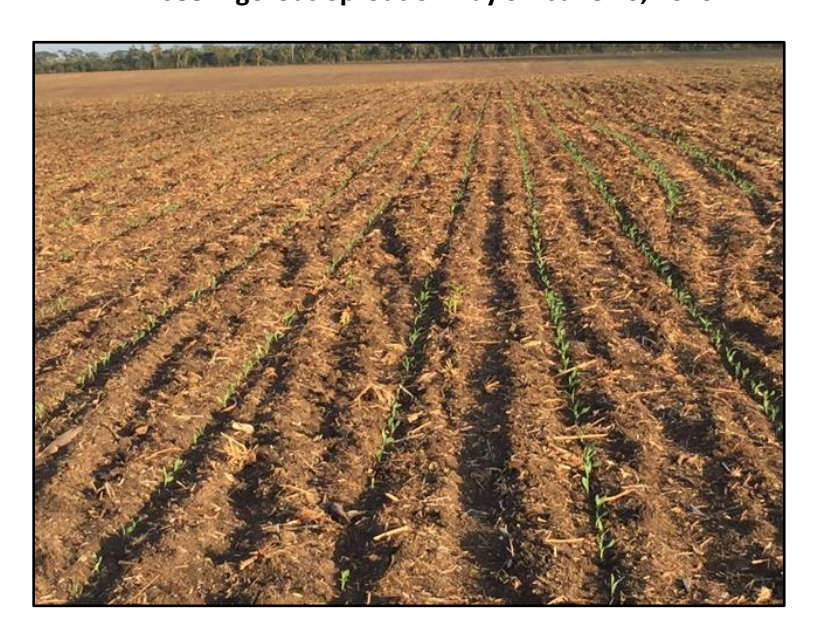
Field 1 on Day 9 – June 10, 2016