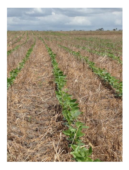
JSN BEB Field – San Felipe (March 8, 2014)