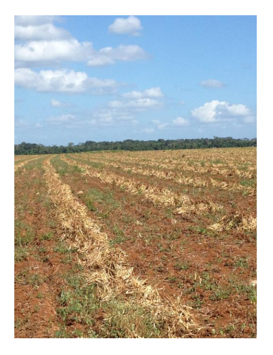
RK Beans Windrowed (March 6, 2014)

The first 16 acres of RKs were pulled on the 21<sup>st</sup> of February and the first beans were harvested on the 28<sup>th</sup> of February. To date the Thiessens harvested 100 acres of the JV RK beans, with yields ranging from 1,300-1,500 lbs/acre on the non-irrigated fields and 1,600-2,180 lbs/acre on the irrigated fields.