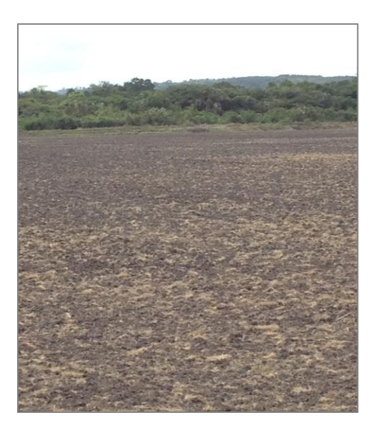
Marlon Dyck Rice Fields (March 8, 2014)

Marlon has 170 acres that are ready to be flooded, with an additional 90 acres ready by Tuesday, for a total of 260 acres ready to plant on Wednesday, March 12. The remaining acres will be ready to plant the following week.