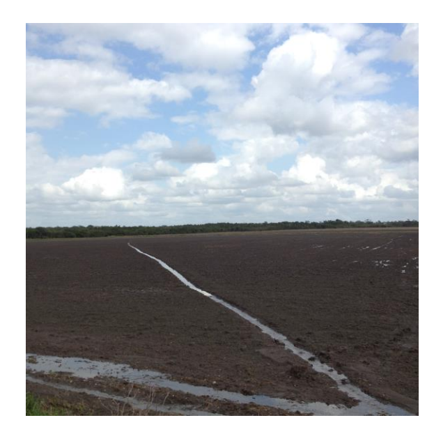
JSN Blue Creek Rice Fields – Drained (March 8, 2014)