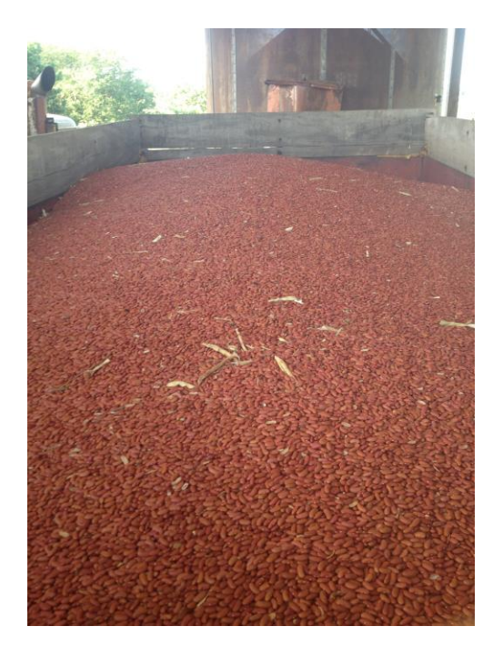
Thiessen RK Beans (March 6, 2014)