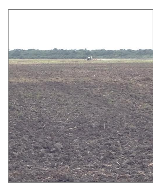
Marlon Dyck Rice Fields (March 8, 2014)