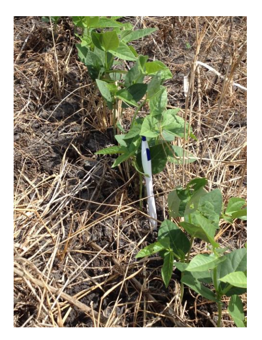
JSN BEB Zoom – San Felipe (March 8, 2014)

Jacob Neufeld ("JN") planted 70 acres of Black Eyed Beans ("BEB") on February 18<sup>th</sup> and 30 acres on February 21<sup>st</sup>, for a total of 100 acres. As we reported last time the remaining acreage (~110 acres) was abandoned as the ground was too wet to plant, and we had passed the "safe" final date for planting. The BEBs are 20 days into their growing stage; the stand is well set with good germination, although growth is a little less vigorous than we would have expected. This may be due to wet planting conditions (now abating), but we will be monitoring growth for additional fertilizer requirements.