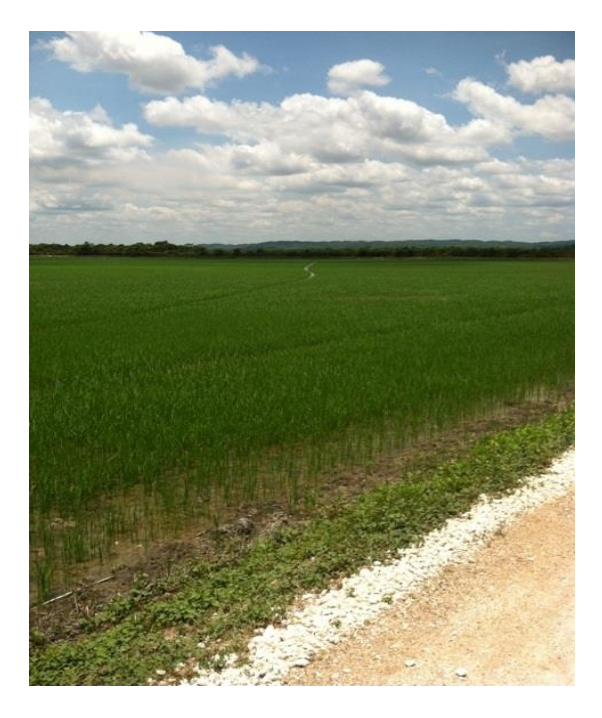
Marlon Dyck Rice Field 210 at 41 days (April 22, 2014)

In general, the fields look good; however, better drainage with proper leveling would improve these fields by a further and significant margin! For the next crop cycle, acreage where we would plan on growing rice will go through a leveling program and drainage will be improved.