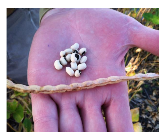
JSN Black Eye: Individuals Beans (April 22, 2014)