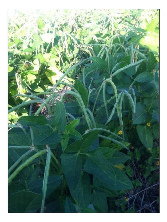
JSN Black Eye: Well Filled Pods (April 17, 2014)