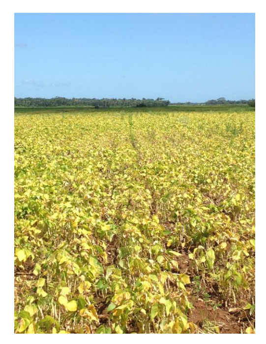
Thiessen RK Beans (Feb 20, 2014)