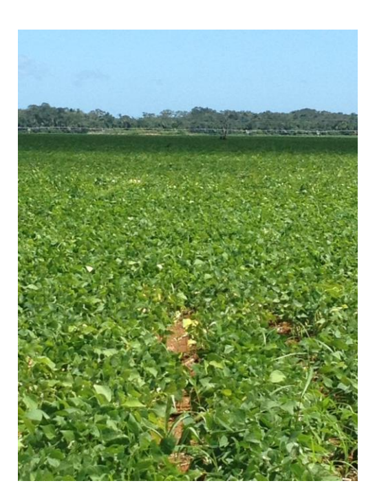
Thiessen RK Beans (Feb 20, 2014)