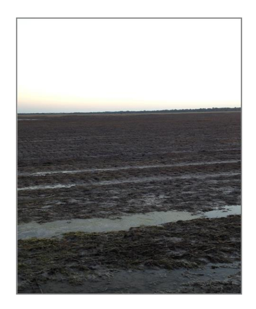
Neufeld Rice Field (Feb 22, 2013)