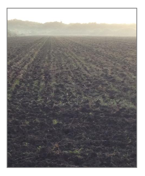
Neufeld Rice Field (Feb 22, 2013)