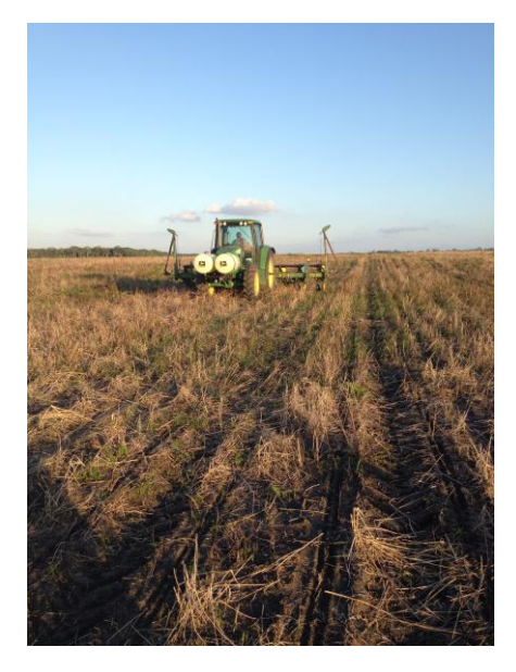
Neufeld BEB Field (Feb 18, 2013)

Jacob Neufeld planted 70 acres of Black Eyed Beans ("BEB") on Feb 18<sup>th</sup> and 30 acres on Feb 21<sup>st</sup> for a total of 100 acres. Due to the heavy and late rains this season, with about half of the fields still being too wet to plant (see pictures below), a decision was made not to plant the remaining 110 acres. By the time these remaining acres might be planted, even assuming the weather would rapidly dry the fields, the resultant harvest date would be in mid-May, when the risk of showers is too great. As a reminder, if BEBs get wet during harvest, they discolor rapidly and lose 75% of their value.