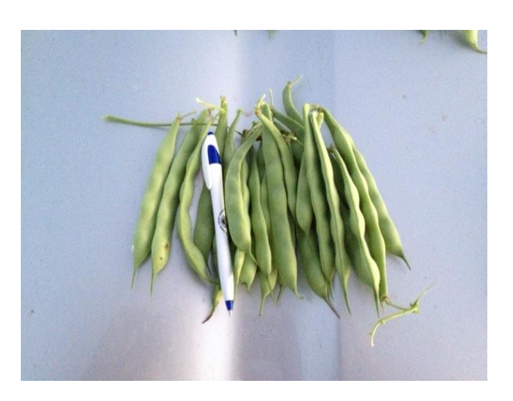
Thiessen RK Bean Pod count (Feb 7, 2014)