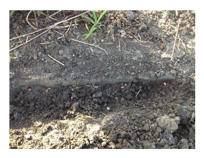
Neufeld BEB Singulation (Feb 18, 2013)