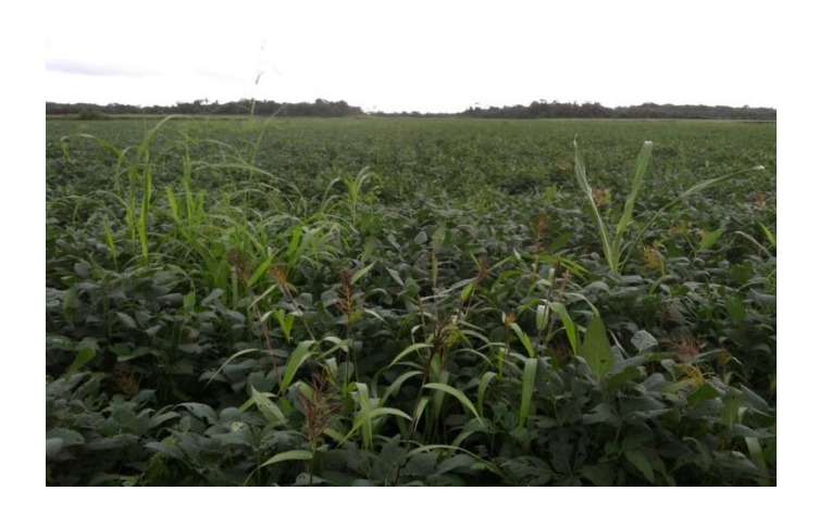
Field #JN1 - Planted June 27, 2013: 60 acres