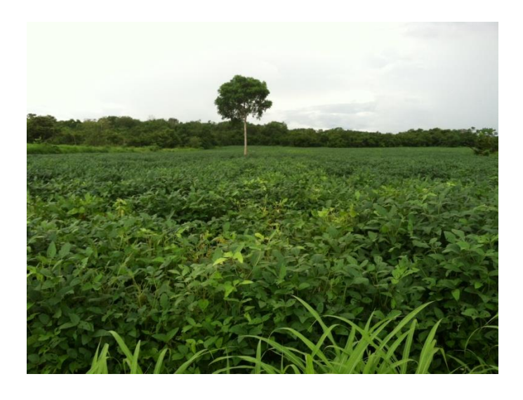
Field #JN3- Planted June 27, 2013: 17 acres