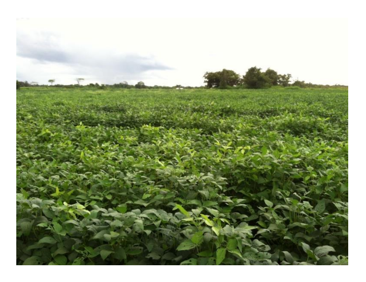
Field #JN4- Planted June 28, 2013: 20 acres

Jacob Neufeld finished planting on June 28, 2013, and despite what looked at first like a low stand on his field, the crop is now looking very good. These fields have received 3 inches of rain in the last week, although the red soils in the San Carlos area tend to drain very well. These beans are really looking good! The fields are as good as done with flowering and pods are forming very well. A pod count was done yesterday.