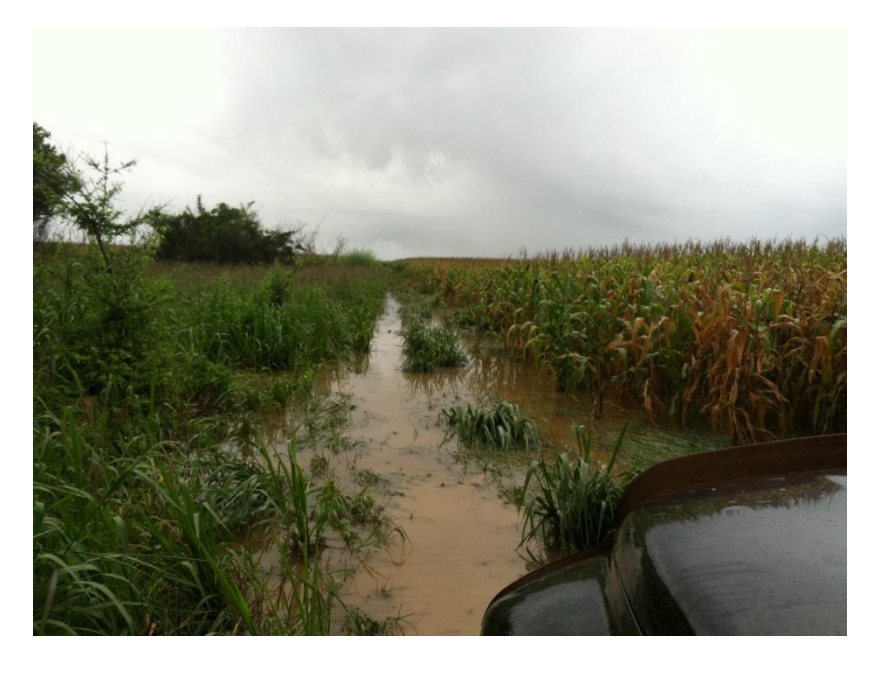
Thiessen Field – Southwest Corner (September 9, 2013)

As can be seen in the picture above on the right, flooding is a bit of a problem on the south west part of the Thiessen field. Some drains had been cut during the dry season, but obviously not enough. I talk to the neighboring land owner yesterday about cutting a drain across his land which is still under jungle. He gave me permission to do the work and so the Thiessens are in the process of getting a drain in. With the corn stalk still being green I don't anticipate a material crop loss due to the water, provided we can get the water off. This again shows that drainage is as important as irrigation.