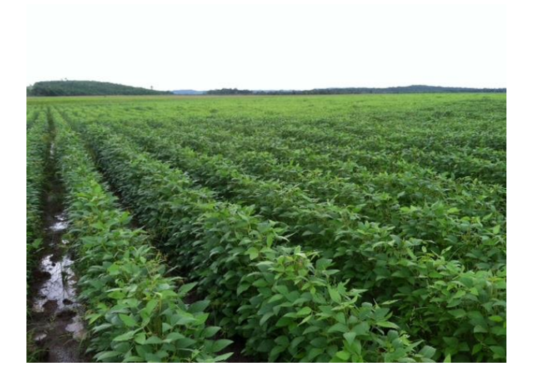
D&H Soybean Field (Aug 31, 2013)

A preliminary survey of the D&H Soybean field was carried out yesterday, however it is too early to draw any reliable conclusions as the pods are forming; they will fill out in the course of the next fortnight. Therefore we cannot accurately assess the true pod count, which is a critical data point. What we can say is that plant count is low (~52k/acre) but with a high pod count (~83). The critical factor to assess yield will be what percentage of the pods which have formed will fill out. As we won't have a good feel for this for another fortnight, we will defer any yield estimates until then