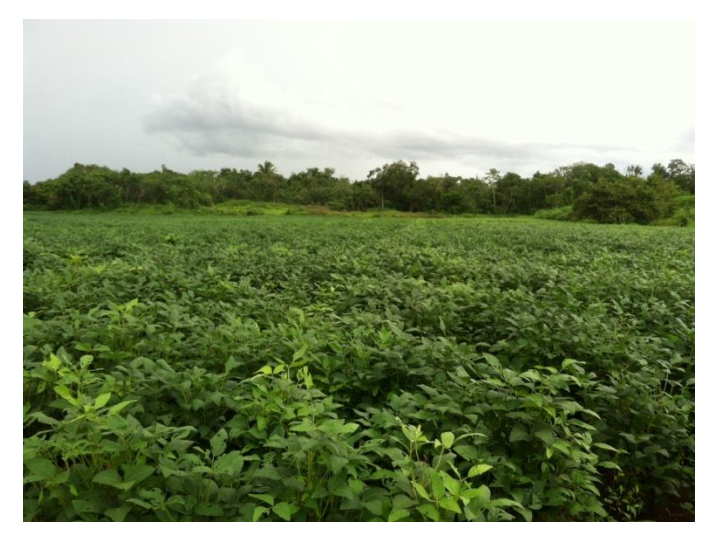
Field # JN2 - Planted June 27, 2013: 20 acres