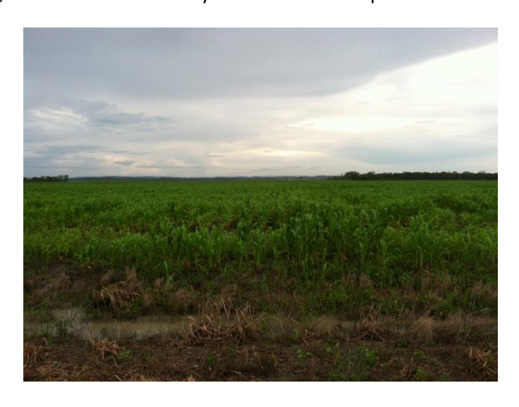
D & H Field 2 (Sept 9, 2013)