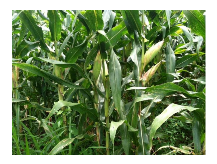
Thiessen Corn Field – August 26, 2013