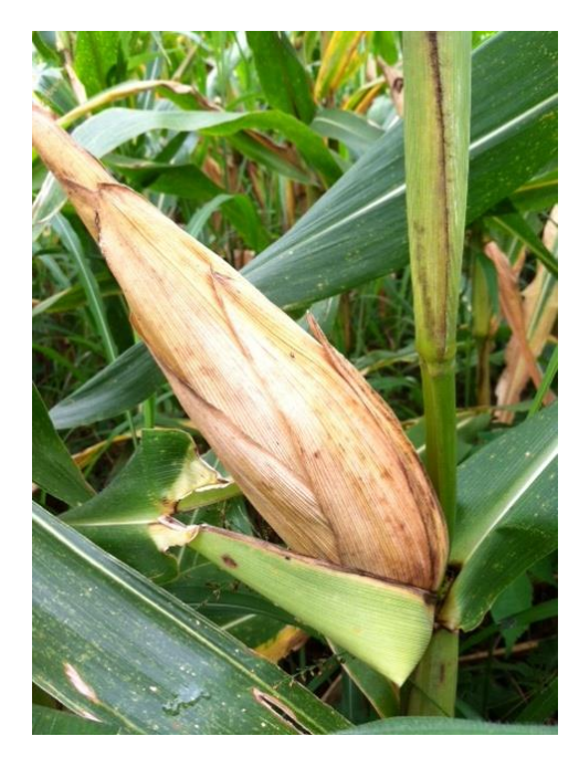
Thiessen Corn Field - Dekalb 7088 (Sept. 2, 2013)

Spider mites and worms were a moderately severe problem this season, but the bigger problem was a lack of agro chemicals to treat them. This is an important and enduring lesson for future crops, especially as the acreages become larger. Key agro-chemicals will have to be pre-purchased and stocked in secure locations to ensure they are available immediately when needed.