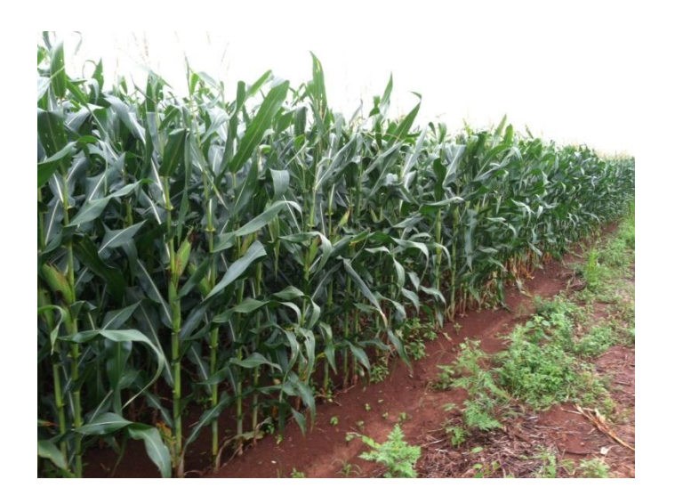
TF Plantation Field TF4 (Sept. 9, 2013)

We are now maintaining the weighted average yield from the TF Plantations fields TF 1-2-3 to 125 to 145 bushels per acre, and setting TF4 at 130 to 150 bushels per acre. This compares with our initial blended (irrigated and non-irrigated) target of 107 bushels per acre, and historical blended yields of 90 bushels per acre. The TF Plantations yields (historic and target) are higher than the Thiessen yields principally due to higher percentages of irrigated land.